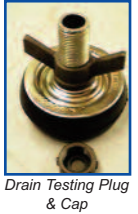
Drain Testing Plug & Cap