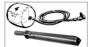
Air Bag Stopper & Hand Pump